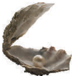
The Powerful Gem